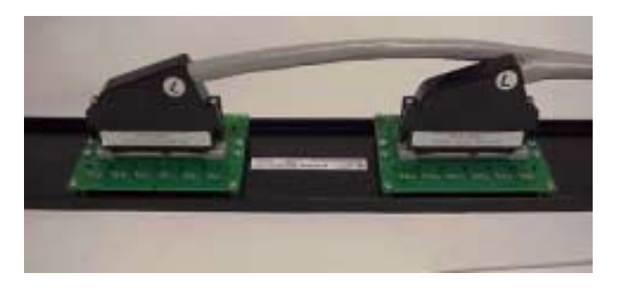
Figure D-2 Cable Attached to the Panel